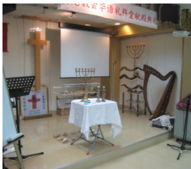
A tabernacle for praise & worship in Hong Kong.

Rabbi then asked me, "So what are you going to do in China this time?" I replied, "Teach Torah and the Bible. Teach how the Lord our God is One (Heb. echad ) and how to have faith (Heb. emunah ) in the midst of trials as the Chinese increase my faith as well." Rabbi nodded and said, "Good. If I am still here when you return, we must start another Torah study group." I quickly replied, "You will still be with us rabbi!" He shrugged his shoulders and quietly said with a smile, "If I am still here..." Rabbi passed away a day before I came home. I've never forgotten our timely meeting, nor his words. They were meant for me to hear.