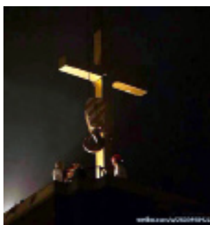
In China, a number of churches have been razed to the ground and crosses continue to be dismantled day and night.