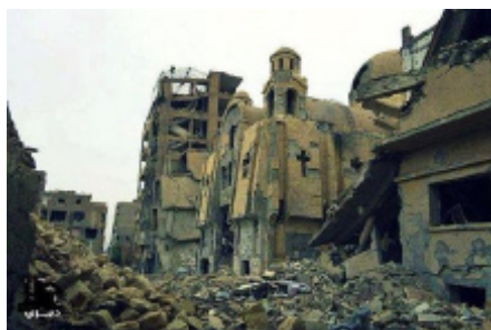
Hundreds of churches and monasteries in the Middle East, like this one in Syria, continue to be destroyed.

Jesus departed from the temple area and was going on His way, when His disciples came up to Him to call His attention to the buildings of the temple and point them out to Him. But He answered them, "Do you see all these? Truly, I tell you, there will not be left here one stone upon another that will not be thrown down."