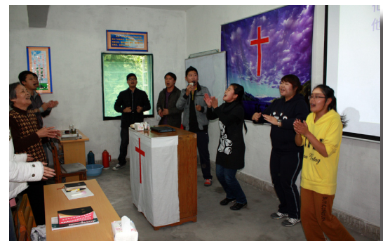
May Chinese hearts beat at one with our Lord.

I return back to China in October and November to teach and train with our staff. The churches are hungry to learn about Israel, the Tabernacle and how it pertains to their lives today. They've been preparing.