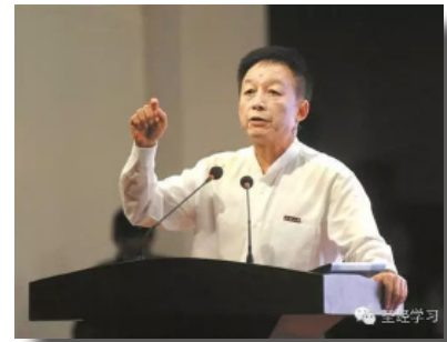
Professor Yi Zhongtian

Thankfully, God has raised up notable Chinese leaders in their keys areas of expertise for a time such as this -- Jack Ma (business) and Professor Yi (history/literature). They've been transparently sharing what China truly needs for its future. They are aware . From Professor Yi's studies and astute observations, only a focussed and devoted love relationship with the One true God will secure China and her people's destiny.