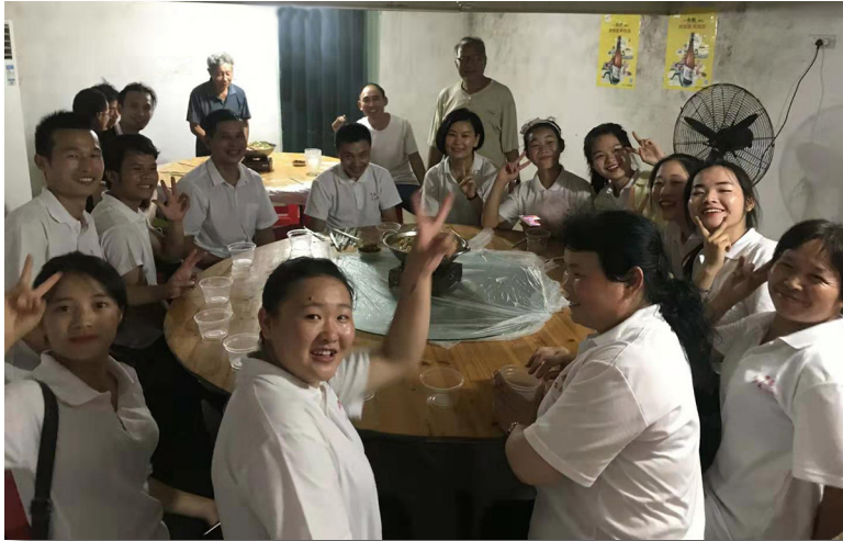
The joy of the Lord is present in all the co-workers as they serve together.

One of the main reasons why our living God came down in the flesh was to reveal Truth. In fact, He literally stated that this is why He was born (John 18:37). In a world now filled with disinformation and deception, those who have chosen the Way, the Truth and the Life (John 14:6) are honing their spiritual and physical senses to discern between good and evil, righteousness and unrighteousness. Most importantly, they're learning how to live and apply these biblical virtues in a Godly manner.