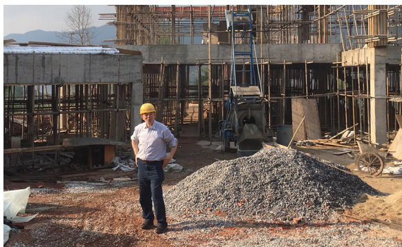
We assist and provide counsel to a brother whose vision is to build a hostel/retreat with the very top floor being a prayer room for all nations.