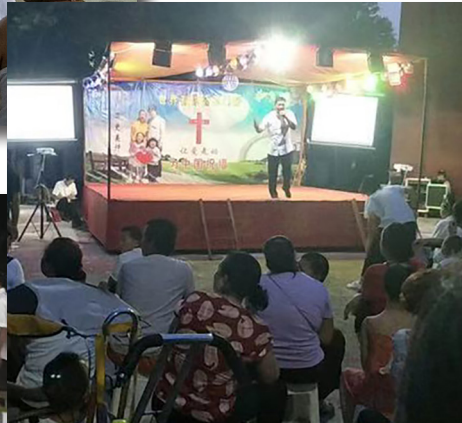
Presentations go well into the night. The focus is on God's heart for harmony in the family and His eternal plan for humanity.