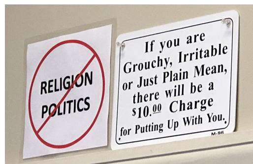
There are days when you feel like this store vendor in Seattle!

So although the CCC may have its particular perspective and rhetoric, it appears most Christians inside and outside of China feel quite different. Although there is still engagement with overseas churches, there seems to be a major disconnect with what is said and what is now the current trend. East Gates is fully aware of all these issues and tries to stay out of the contentious religious and political debates. Our focus is to look for the positive and be the best asset we can be to all Christians in China.