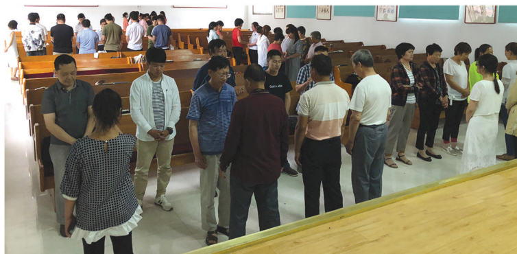
We teach House church brothers and sisters how to go deeper into prayer and how to pray with each other. Much needed for these times.