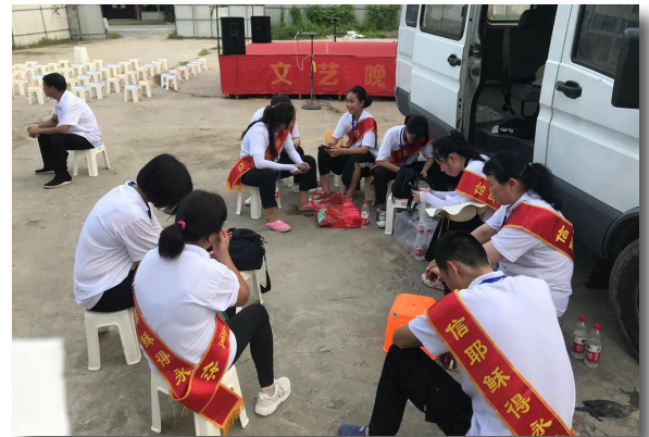
Each gathering takes much prayer, preparation and financial investment.

Chinese believers whom we have supported and equipped for years have been going out and sharing God's Truth with all those whom God leads them to. Recently, they spent a lot of time preparing for a celebratory gathering whereby they would share not just God's good news but Life-giving news!