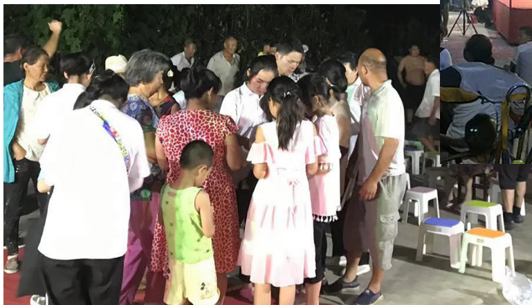
The attendees receive prayers, Bibles and church information.