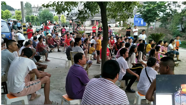
Interested attendees gather to listen.