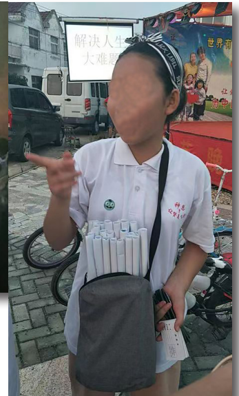
A believer gives out flyers and raffle tickets for free gift drawings.

* Side note: Given the present religious climate, church names and locations are not mentioned.