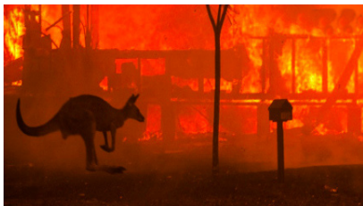
2019-2020 Australian fires.

Before Yeshua's last Passover Seder with His disciples, He prophetically expressed, "This cup (vessel) which is poured out for you is the New Covenant in My blood." Luke 22:20