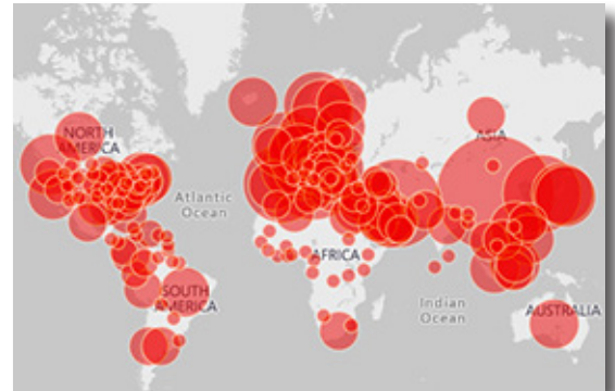
The COVID-19 pandemic as it continues to spread around the world.

Another message we've been sharing is how Life is in the blood ( Lev.17:11 ). God created blood so it could nourish and eliminate waste in our "temples." That's exactly what Yeshua our Savior did and continues to do. As the Bread of Life and Living Waters, He nourishes us completely and through His ultimate sacrifice, He cleansed and removed from us all of the toxins, poisons and impurities that create disease. Sin causes one's temple to be in a state of "dis-ease" or not in a state of being "at ease" or shalom -- whole, complete and at one with God.