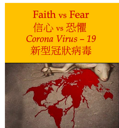
East Gates' online presentations during this time of quarantine and lock-down.