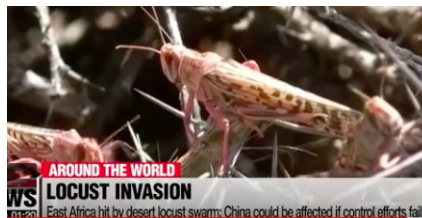
2020 East Africa, Middle East and China locust plague.