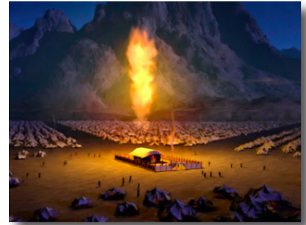
God’s tabernacle was in the midst of Israel and the mixed multitude. There were no outside distractions. Did they make the best of this precious time?

During this time of quarantine and lock-down, it seems as if God has taken us into a wilderness season just like when He took Israel out of Egypt (representative of the world) so they could hear His voice only. Moses, the 12 tribes of Israel and the mixed multitude were now sequestered where they could have private time with their Creator. In a sense you could say God made sure they were quarantined from any “corona viruses (pharaohs),” “bacteria (Amalekites),” or “germs (secular culture)” that would want to create terror and disease within. The Israelites just had to make sure their carnal mindsets they took out of Egypt would be made impotent with their immersion in God’s way of Life and Spirit. Did this happen? Where were their hearts and minds? We need to ask ourselves the same questions.