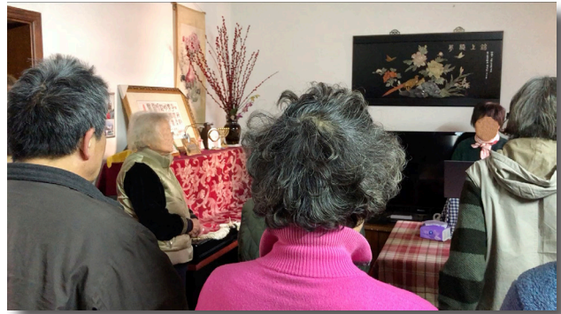
The visually-impaired brother is in the gray jacket (left). One could tell immediately this "upper room gathering" was part of God's faithful remnant. There was overflow in the side bedroom.

The elderly hostess wanted us to sit up front but we chose the back row. We were so glad we did because in the row just in front of us was a visually-impaired brother who was asked to give the opening prayer. It was so sincere and passionate, we quickly started recording it (see below).