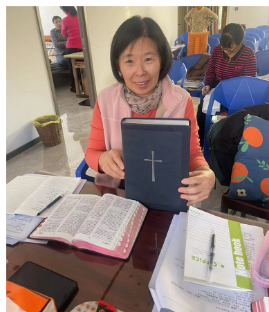
Our East Gates co-workers continually provide Bibles and training classes during these crucial times.

As youth, Chinese were not taught critical thinking skills so we teach our students they must pray under the inspiration of the Holy Spirit to discern what is truth and what is error. Do not let the serpent (dragon) bite you as he did Adam and Eve in the Garden. Do not blindly follow leaders like the biblical High Priest Aaron or King Jeroboam when you know God’s will through His Spirit and Word. They do not contradict each other.