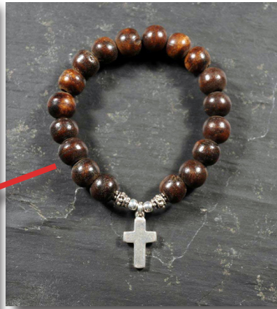
A bracelet worn by someone who believes that Buddhism and Christianity can be their “lucky charms.”